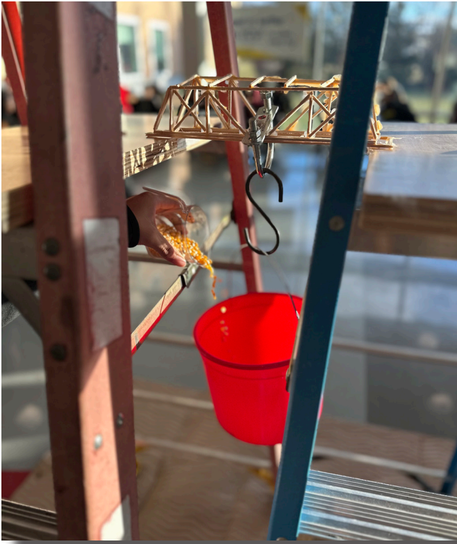
A bridge undergoes testing to see how much weight it could support.