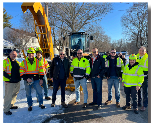
RI Governor Daniel McKee and his staff (pictured centered) visited CTDOT crews who were clearing roads in February.

This assistance was deployed under the Emergency Management Assistance Compact (EMAC), the nation’s all-hazards national mutual aid system. The last time CTDOT was deployed through EMAC was 2016, when staff and equipment headed to Buffalo, NY following a storm.